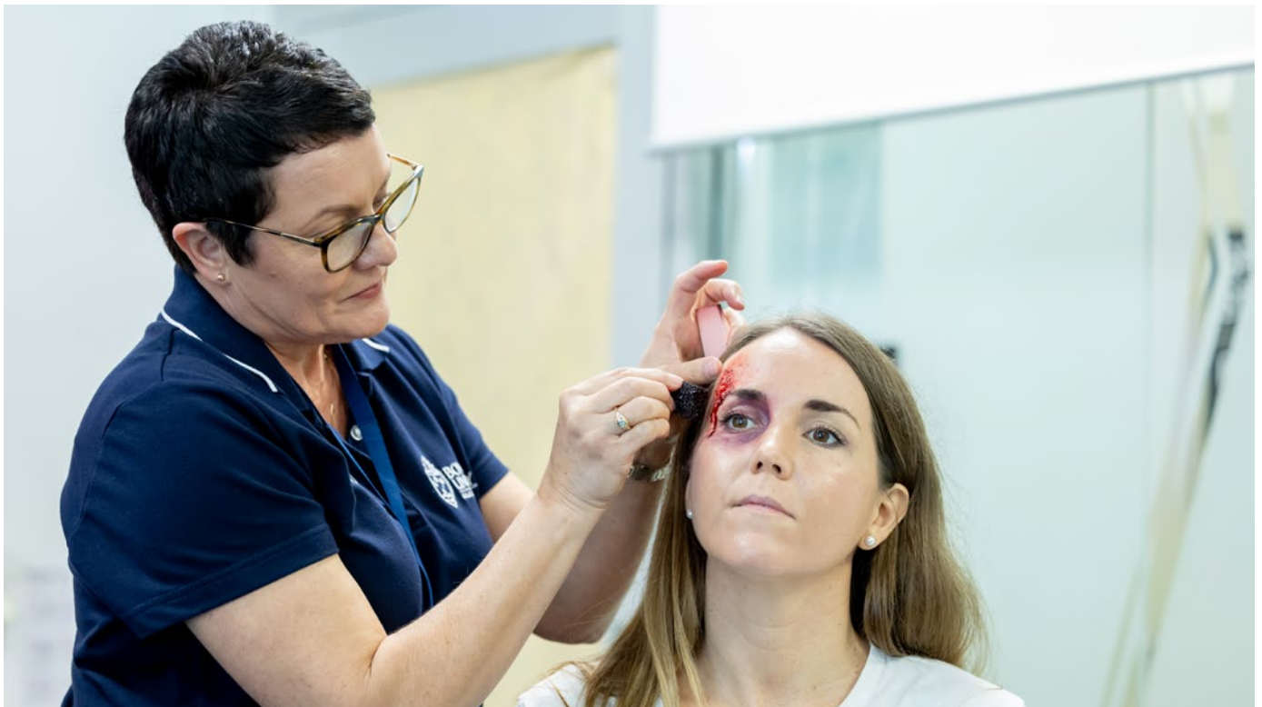
Moulage or visual effects makeup is used as a training tactic within highly-immersive hospital settings

Graduates of Bond Medical Program are eligible to apply for accredited intern positions in Queensland and across Australia.